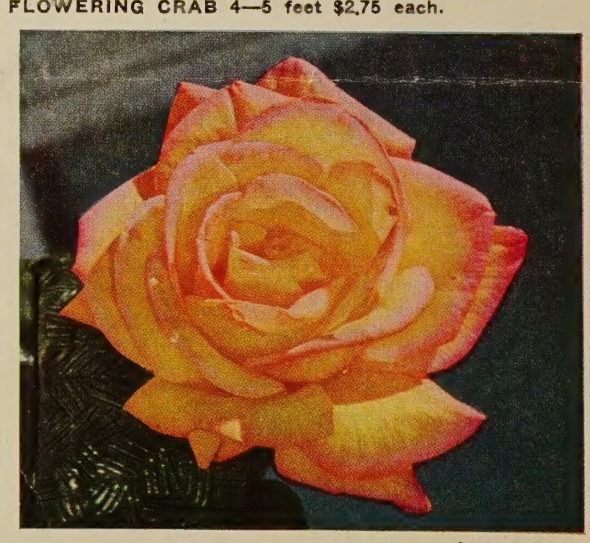
Peace (Plant Pat. No. 591) $2.50 each